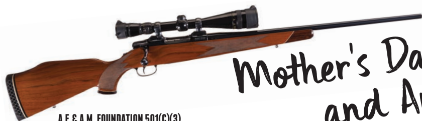
A.F. & A.M. FOUNDATION 501(C)(3)

CAR SHOW | BOUNCE HOUSE | RAFFLE UP TO $10,000 CASH, UP TO 10 FIREARMS & MUCH, MUCH MORE!