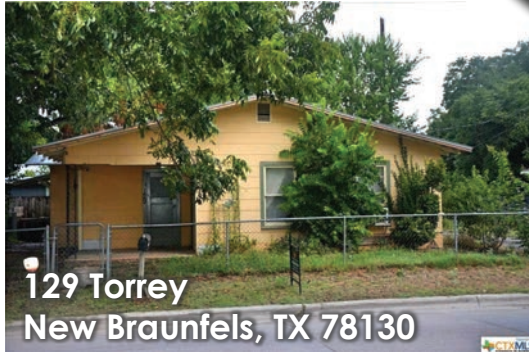
129 Torrey New Braunfels, TX 78130

2 bed, 1 bath | Rental 936 Sq. Ft., 2,522 Sq. Ft. Lot