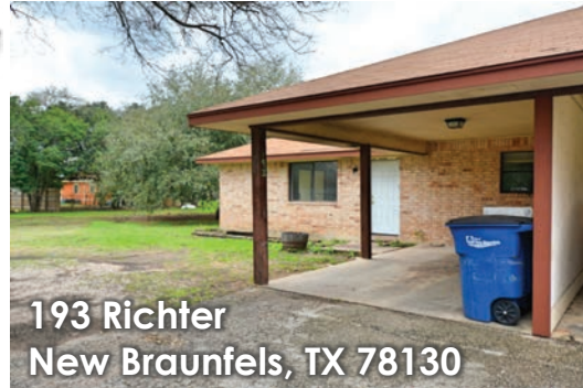
193 Richter New Braunfels, TX 78130

2 beds, 2 baths | Rental 968 Sq. Ft., 17,799 Sq. Ft. Lot