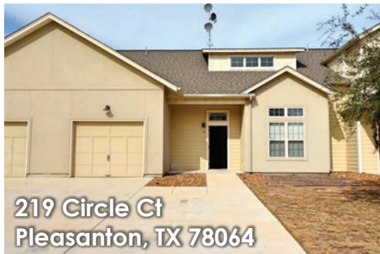
219 Circle Ct Pleasanton, TX 78064

3 beds, 2 baths | Rental 1,679 Sq. Ft., 2.399 Acre Lot