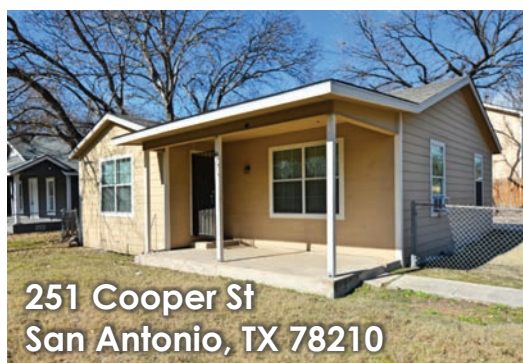
251 Cooper St San Antonio, TX 78210

3 beds, 2 baths | Rental 1,268 Sq. Ft., 7,405 Sq. Ft. Lot