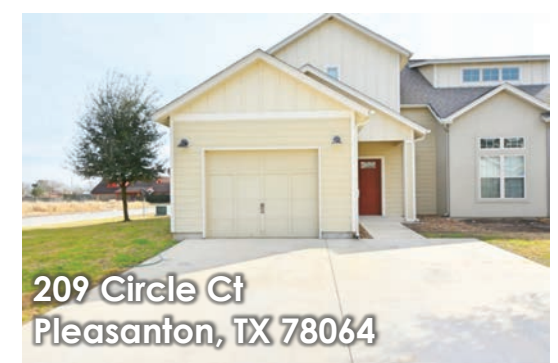
209 Circle Ct Pleasanton, TX 78064

2 beds, 1.5 baths | Rental 1,544 Sq. Ft., 17,380 Sq. Ft. Lot