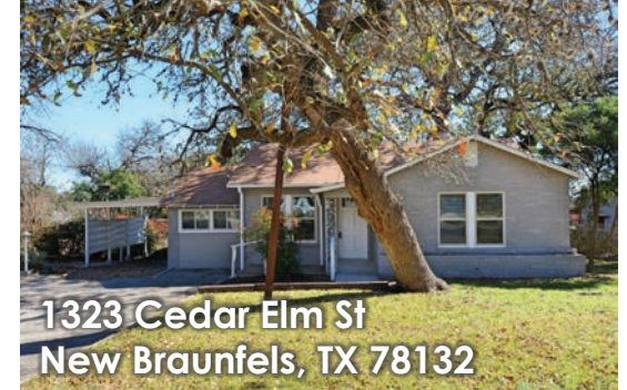
1323 Cedar Elm St New Braunfels, TX 78132

3 beds, 2 baths | Rental 1,372 Sq. Ft., 0.994 Acre Lot